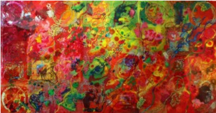
Andrea Dasha Reich's "Complex Red"

Andrea Dascha Reich's "Complex Red" is a bubbly explosion of color. As the title implies, red is the dominant color -- but it's not the only color. Reich works with a painstaking, multilayered resin technique. In this work, there's no single flat picture plane; her painting greets the eye with layer upon translucent layer. Each is packed with squiggly fumaroles of green, orange, white. It's a work you can get lost in. It's complex indeed.