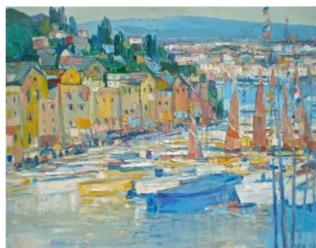
Itallo Botti's "Waterfront"