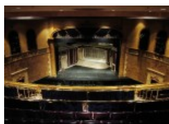
Now Playing Dec. 5-12: Opera