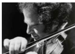
Now Playing Dec. 5-12: Classical