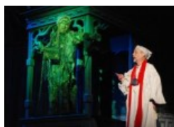
Now Playing Dec. 5-12: Theaters